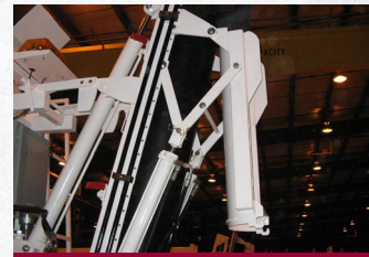
Hydraulic Chute Lift